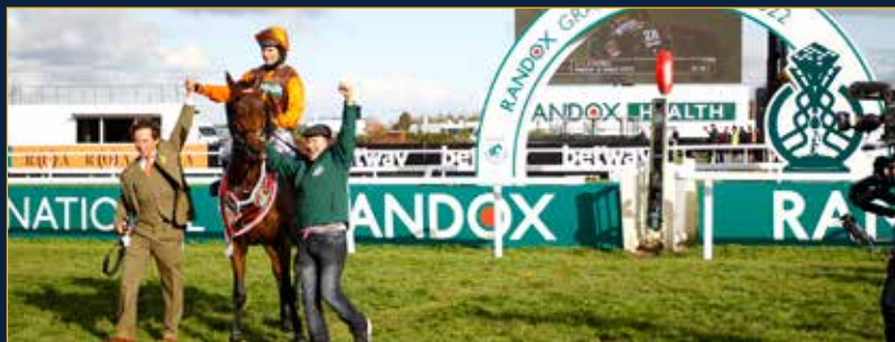
NOBLE YEATS ( above ) winner Aintree Grand National, Gr. 3 sold at Tattersalls Ireland August NH Sale by Glen Stables to Donal Hassett for €6,500